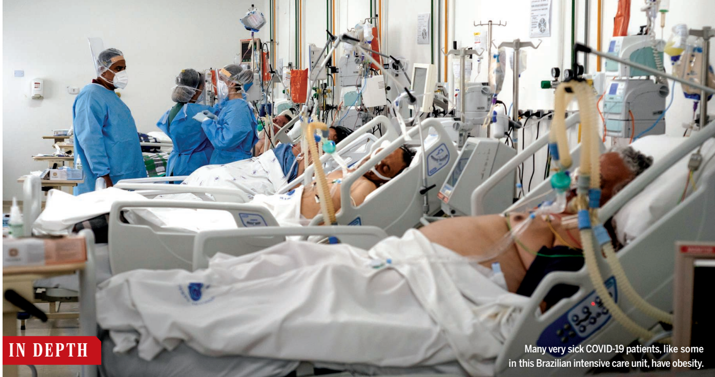
Many very sick COVID-19 patients, like some in this Brazilian intensive care unit, have obesity.